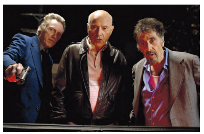
With Christopher Walken and Al Pacino in Stand Up Guys, 2012