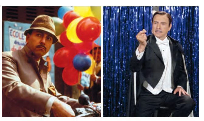
Alan Arkin in Inspector Clouseau, 1968 The Incredible Burt Wonderstone, 2013